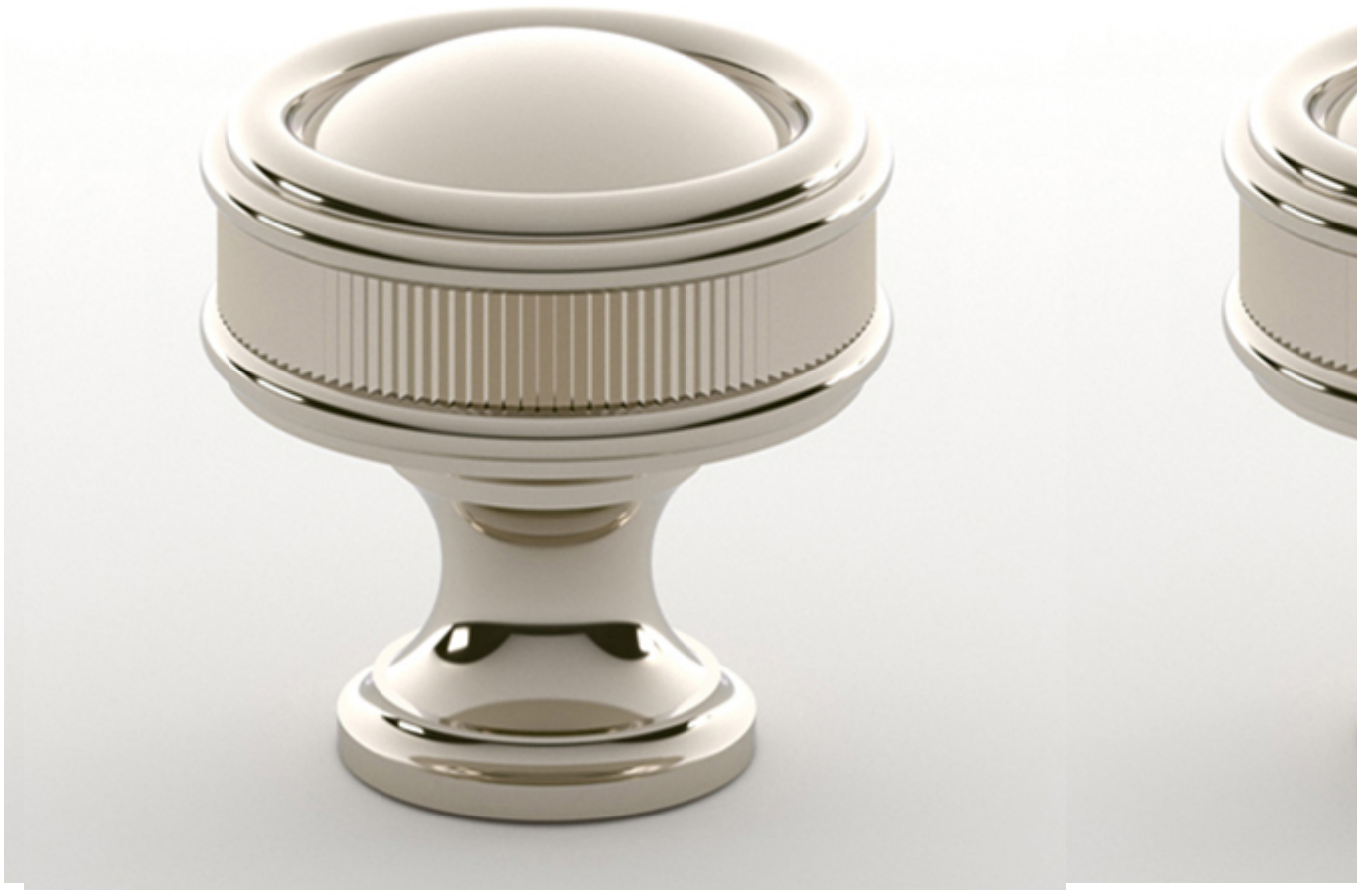
Water Street Brass