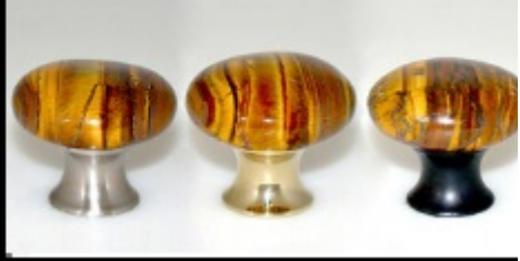
Myterra Gemstone Hardware