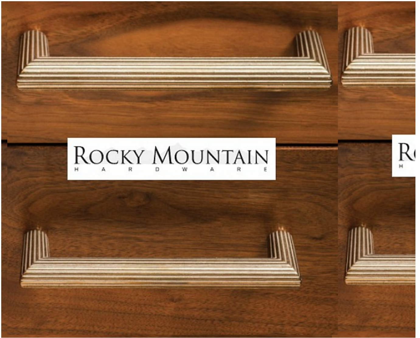
Rocky Mountain Hardware