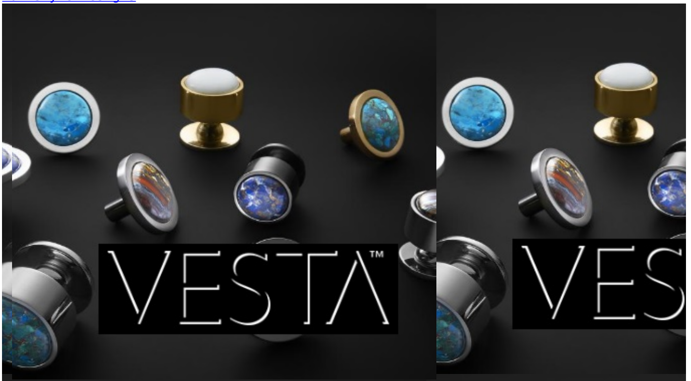
Vesta Fine Hardware