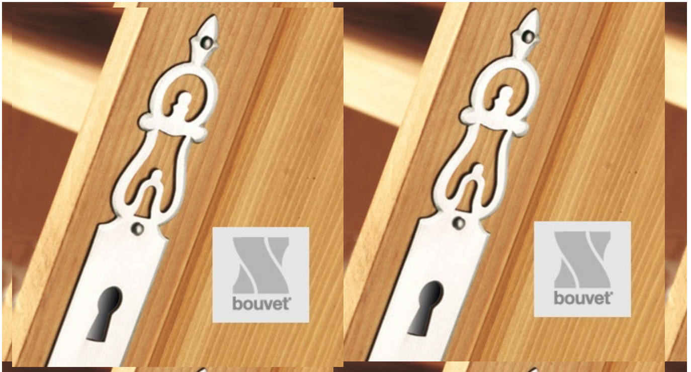
Metal Style Bouvet